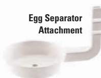
Egg Separator Attachment